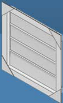
FS - 20