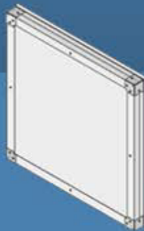
FC - 20