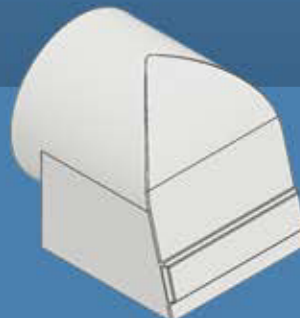
FH - 20